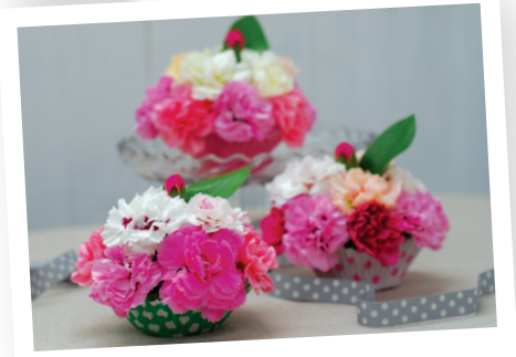
Make a few more ... ta da!